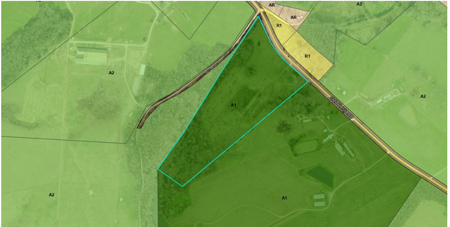
Figure 1 – Adjacent Zoning